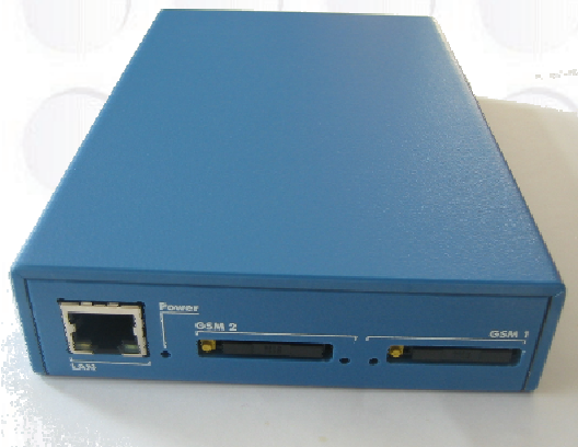
EasyLine with 2 GSM-channels

For more advanced GSM-Gateways, MCS supplies the AS55x range. The AS55x offers many extra features, such as DISA, Callback, LCR + multiple 'building blocks' on top of the Gateway: SMS Comfort, GSM Mobility Extender and IntelliDial. Call support/sales desk for more information.